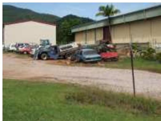
Old vehicles dumped No Change