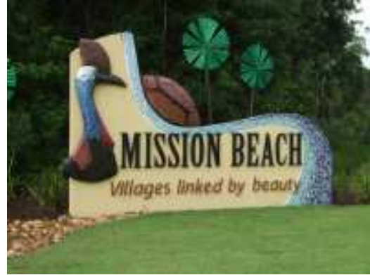
Mission Beach Feature