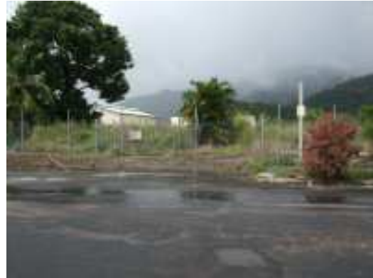
Rubbish dumped in vacant block