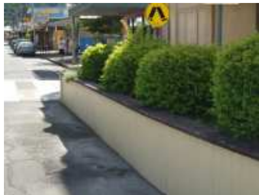
Entrance to Butler Street