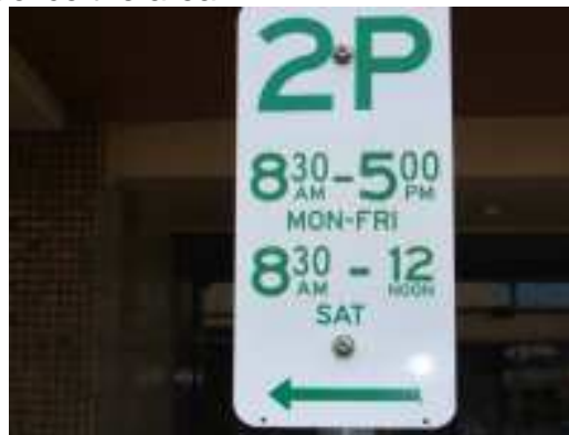
Parking Inspector needed

Tully CBD is a designated 2 hour parking area. The CBD includes a number of loading and no parking zones. Vehicles are being parked for up to 8 hours at a time in Butler Street. Loading zones and no parking zones are being abused. Tully requires a parking inspector to police the area.