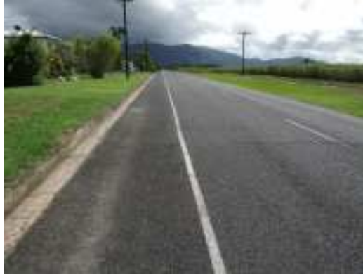
Murray Street walkway