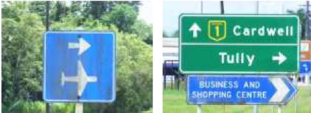
Signs Faded need replacing