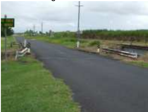
View traveling north

Replace the bridge with a two lane concrete culvert.