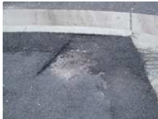
Uneven patchy bitumen surface