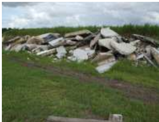
Roadside Lower Tully Road

On Lower Tully Road just a short distant from Lentini Road are several heaps of old concrete slabs. The irresponsible person responsible for dumping this rubbish there should be made to collect it. This is the worst piece of housekeeping possible from a carrying contractor. CCRC should clean up the rubbish and bill those responsible.