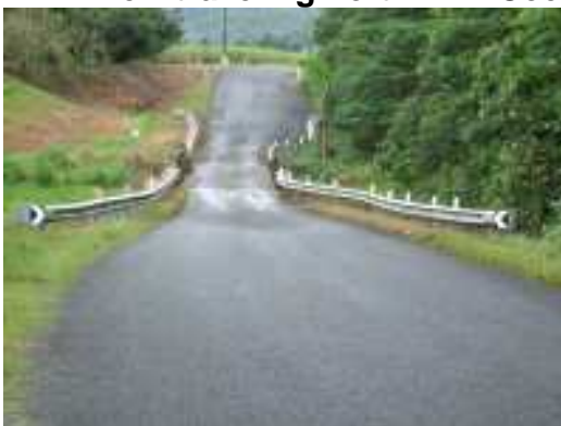
Bookal Bookal Creek Livingstone Bridge