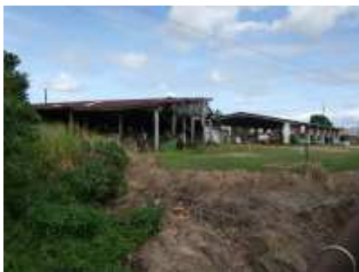
Old sawmill building Work in Progress

One of the buildings has been demolished and rubbish from a vacant block of land has been removed. Work is progressing well on another building. However the allotment where old scrap vehicles are kept has not been cleaned up. CCRC now has to ensure that owners of the vacant allotments keep the area neat and tidy. Refer to page 5.