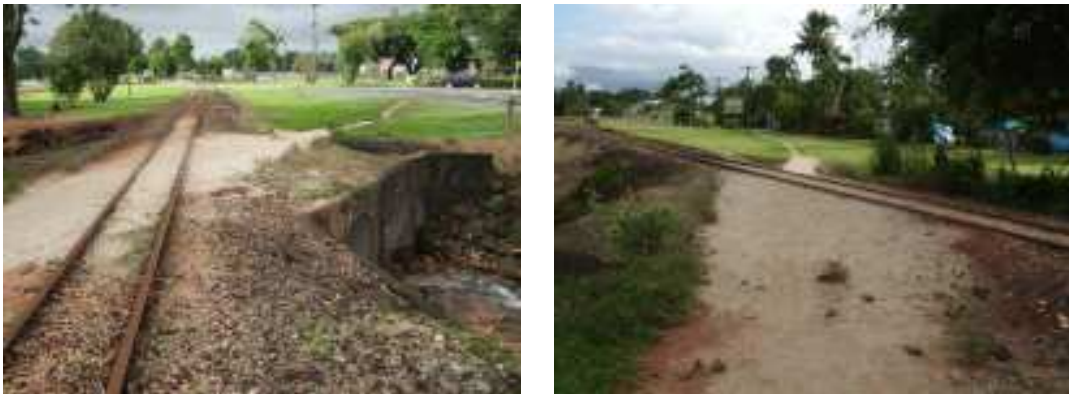
Pathway crossing rail line and culvert

The pathway from the caravan park to Murray Street crosses Tully Sugar rail line. The pathway also crosses on top of a culvert. There are neither warning signs nor handrail on the culvert. This pathway is used constantly mainly by the Korean backpackers. Backpackers are significant contributors to our local economy and every effort should be made to encourage them to stay longer. The safety risk to backpackers using this path can be significantly reduced with only a small outlay.