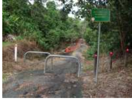
Between Keir Rd and Bamber St