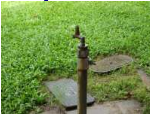
Existing water tap

It is unacceptable not to have fresh water available at the bus shelter in the wettest regions in Australia.