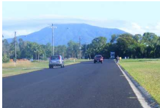
Tully Heads Road showing pedestrian sharing roadway with vehicles

The widened section of Tully Heads Road invites vehicles to drive all the way from the middle of the road to the edge of the bitumen. This is where pedestrians walk. There is a high likelihood of an accident between a vehicle and a pedestrian on this strip of road.