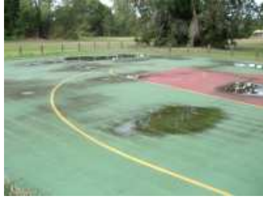
Court mildew and slippery