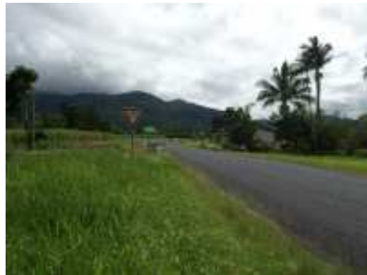
View traveling south