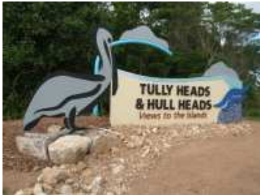
Tully Heads & Hull Heads Feature