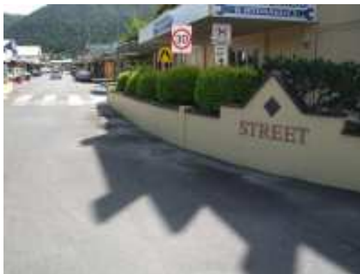
Flowerbeds obscure pedestrian

Have a competent person undertake a risk assessment of all flower beds in Butler Street with regards to pedestrian safety in mind.