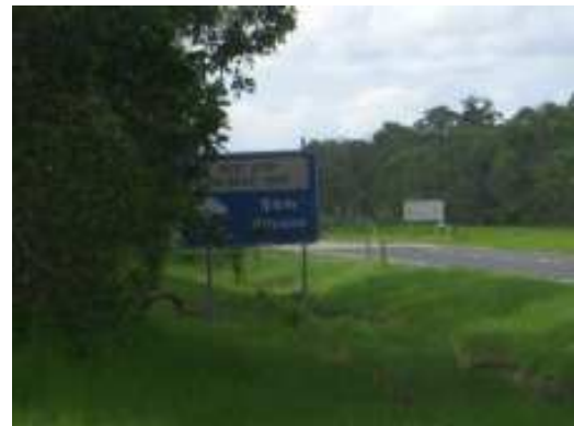
Bilyana Rest Stop