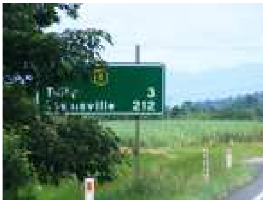
Tree obscuring sign

The Bilyana Rest Stop sign impaired vision to the north of Old Cardwell Road from Bilyana Rest Stop sign on the Bruce Highway near Dallachy Creek.