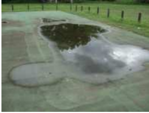
Basketball Court water areas