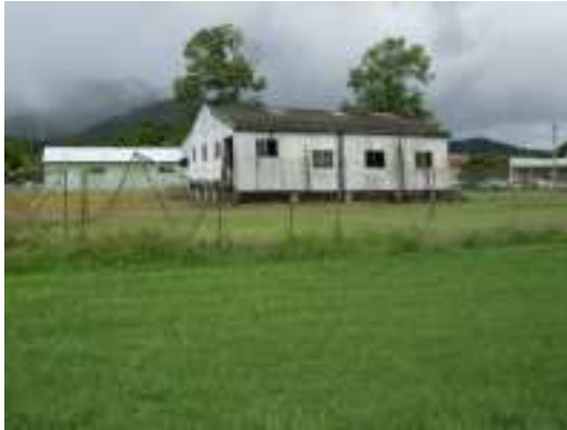
Dilapidated building with with asbestos roof Building Demolished

Queensland Rail has repaired the fence at the old railway station. Work is progressing on re-roofing the old saw-mill building and old stored vehicles have been removed from another property. More work is still required to have the owners of the old BP service station keep the vacant allotment clean.